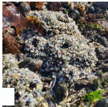
Ridged burnupena Burnupena cincta