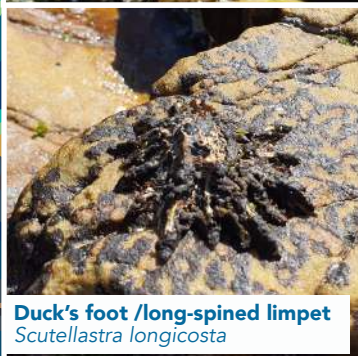
Duck's foot /long-spined limpet Scutellastra longicosta