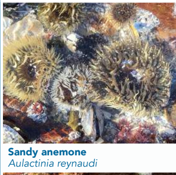
Sandy anemone Aulactinia reynaudi