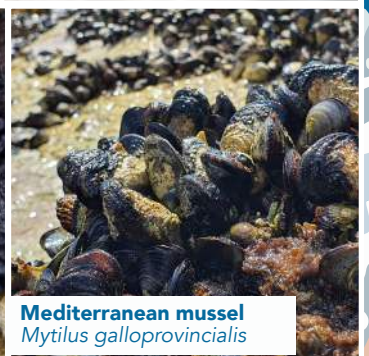
Mediterranean mussel Mytilus galloprovincialis