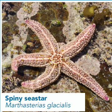
Spiny seastar Marthasterias glacialis