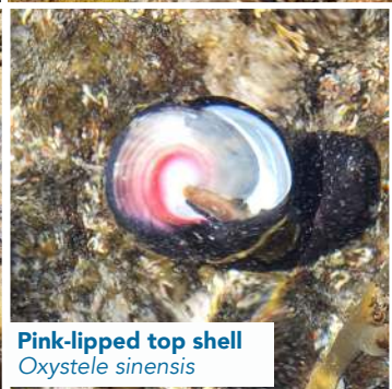
Pink-lipped top shell Oxysteles sinensis