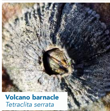
Volcano barnacle Tetraclita serrata