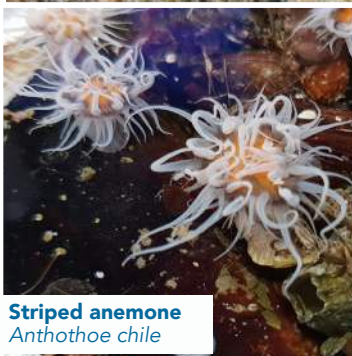
Striped anemone Anthothoe chile