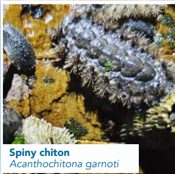
Spiny chiton Acanthochitona garnoti