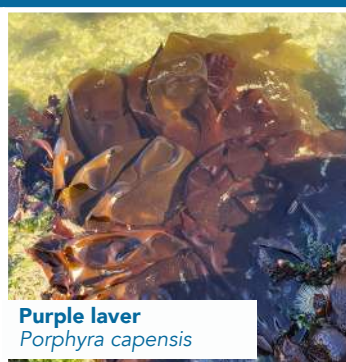
Purple laver Porphyra capensis