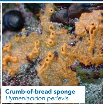
Crumb-of-bread sponge Hymeniacidon perlevis