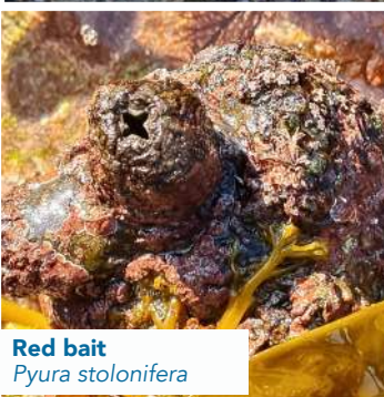
Red bait Pyura stolonifera