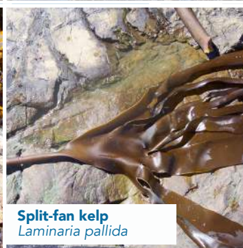
Split-fan kelp Laminaria pallida