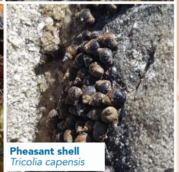
Pheasant shell Tricolia capensis