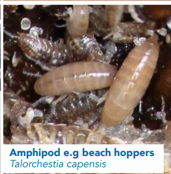
Amphipod e.g beach hoppers Talorchestia capensis