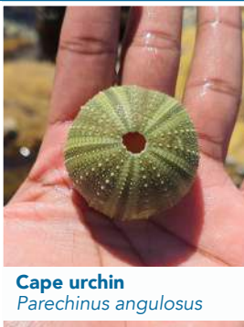
Cape urchin Parechinus angulosus