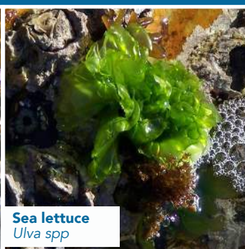
Sea lettuce Ulva spp