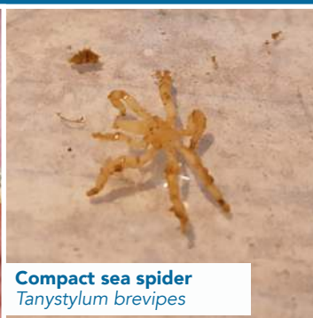
Compact sea spider Tanystylum brevipes