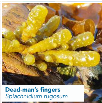
Dead-man's fingers Splachnidium rugosum