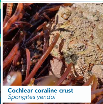
Cochlear coralline crust Spongites yendoi