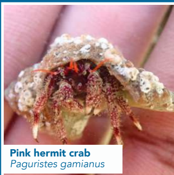
Pink hermit crab Paguristes gamianus