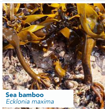
Sea bamboo Ecklonia maxima