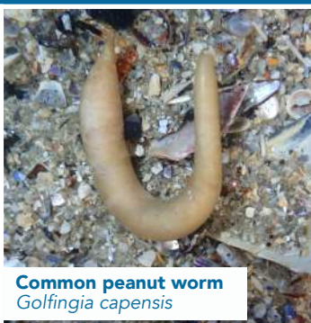
Common peanut worm Golfingia capensis