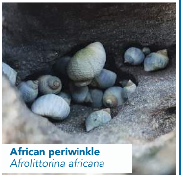
African periwinkle Afrolittorina africana