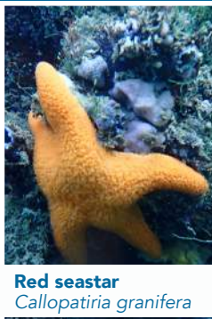
Red seastar Callopatiria granifera