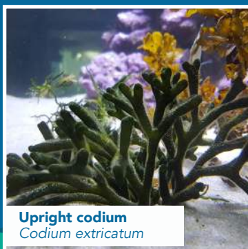
Upright codium Codium extricatum