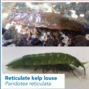
Reticulate kelp louse Paridotea reticulata