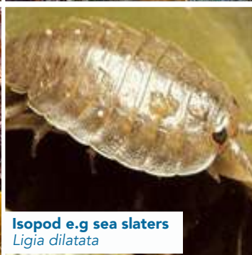
Isopod e.g sea slaters Ligia dilatata