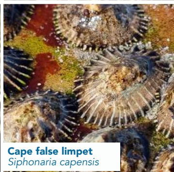
Cape false limpet Siphonaria capensis